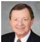
Earl Pomeroy Senior Counsel Alston & Bird LLP

For 18 years, Earl Pomeroy served as North Dakota's sole Representative in the U.S. House. He was a leader in the fight to preserve and promote defined benefit pension plans and employer-provided health insurance.