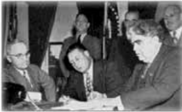
Creation of the UMWA Welfare Fund, May 29, 1946. Pictured seated from left are President Harry Truman, Secretary of the Interior Julius Krug and Lewis. The signing ceremony occurred in the White House Oval Office.

Created to recognize those whose actions emulate those of the man whose vision spawned the creation of the largest, most influential multiemployer funds in history –