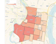
Figure 1a: Community Insight | Geography XX | Nutrition Desert

Decreased Access to Nutritional Deserts: The nutritional desert measure, constructed at the block and block-group level, and assembled into neighborhood level allows for the identification of nutritional deserts among communities throughout the United States. Neighborhoods in red represent communities