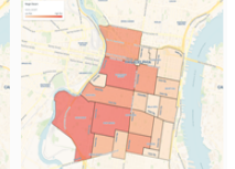
Figure 1b: Community Insight | Geography XX | Nutrition Behavior

Lower Purchasing Patterns of Fruits and Vegetables: Estimates were derived from consumer’s purchasing patterns of fresh fruits, vegetables and whole grains, and attributed back to their residential neighborhoods. This allows for benchmarking against similar communities to understand comparative nutritional behaviors. Neighborhoods in red were underperforming